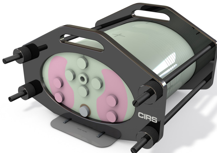
Model 002LFC showing optional water equivalent rod with ion cavity