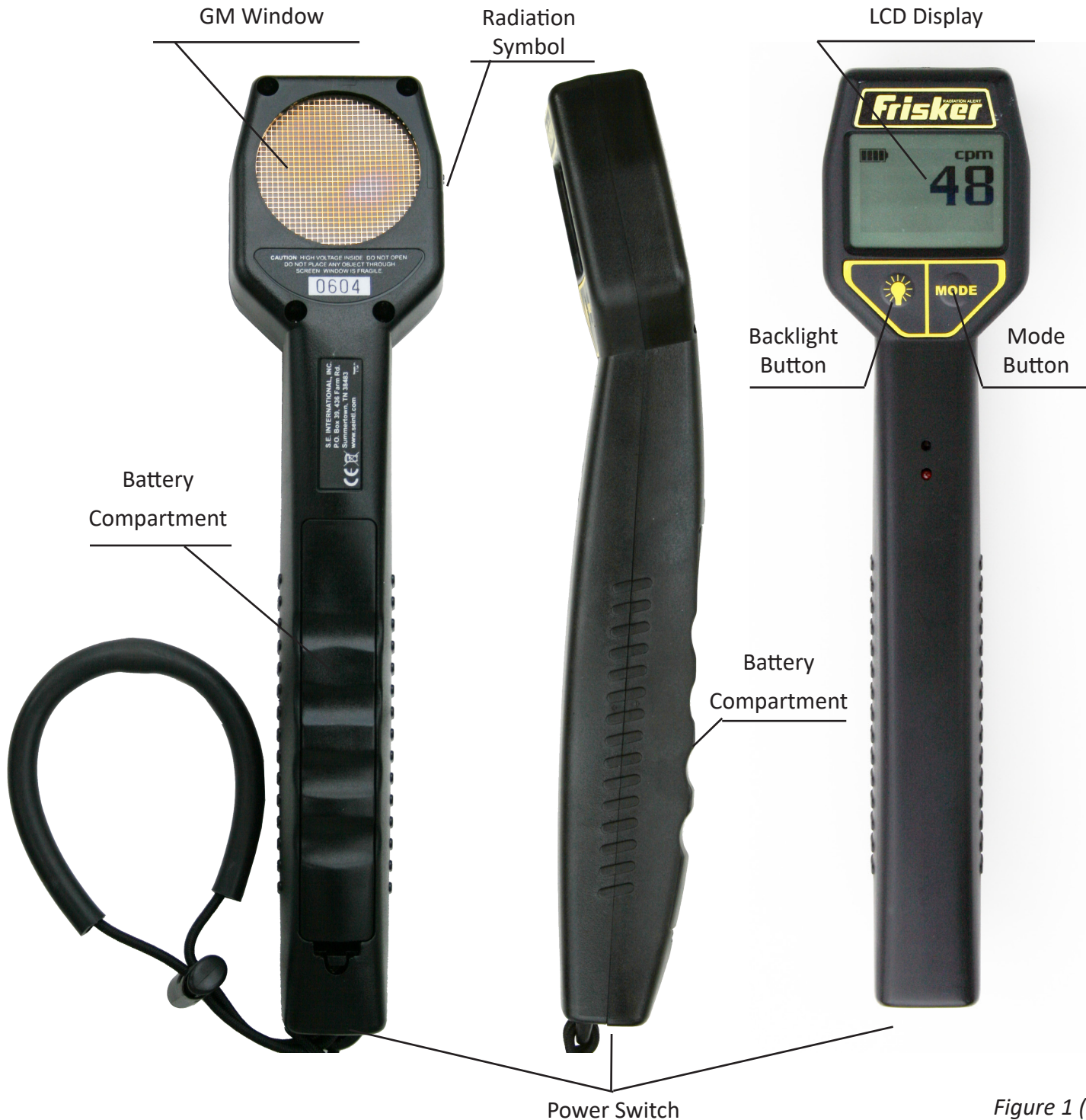
Figure 1 (1).

The Radiation Alert® Frisker uses a 2-inch, thin window Geiger tube, commonly called a “pancake tube.” The screen on the back of the Radiation Alert® Frisker is called the GM Window Figure 1(1) . It allows alpha and low-energy beta and gamma radiation to penetrate the mica surface of the tube. The small radiation symbol on the side of the enclosure indicates the center of the Geiger tube