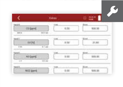
Set analog outputs