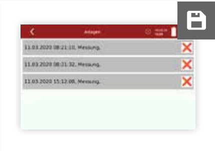
Save measurements by facility