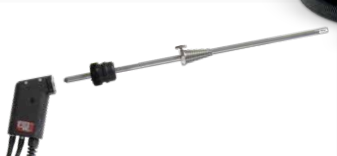
Probe for low dirt applications