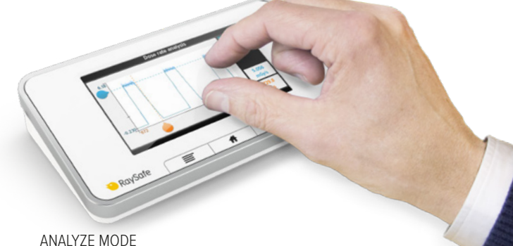
ANALYZE MODE Zoom-in on waveforms to determine, for example, peak dose rate of a pulse.